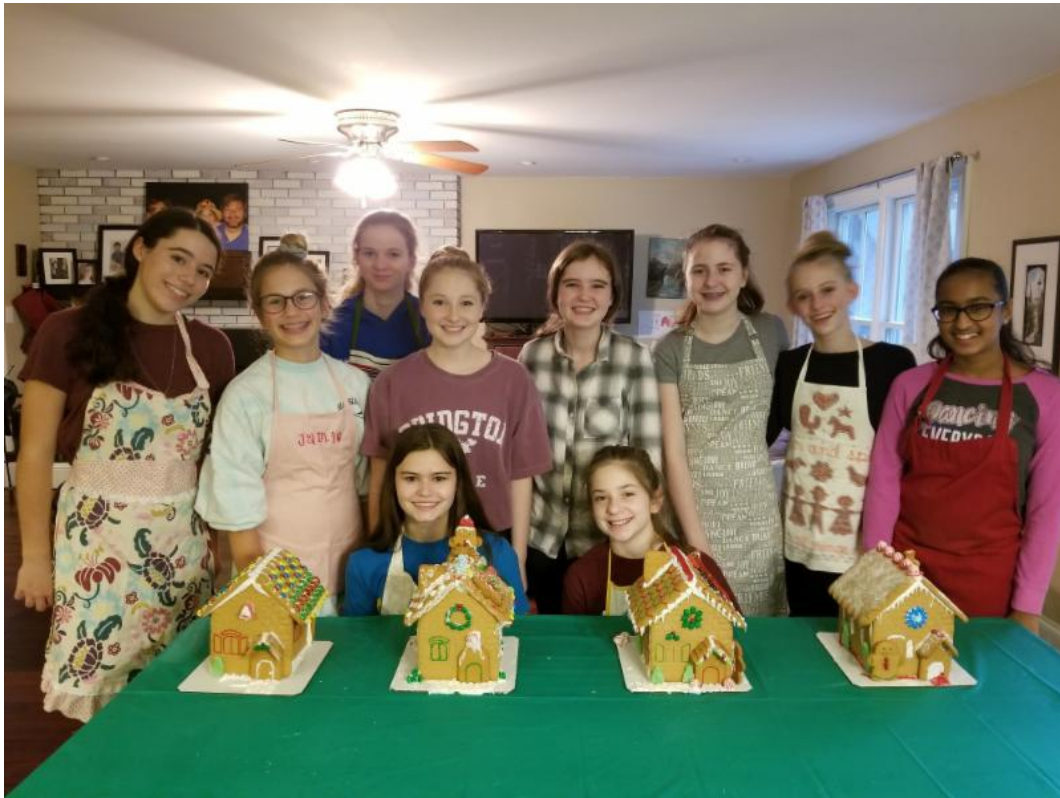
Girl Scout Troop 41050 made Gingerbread Houses to help decorate Devon.

Happy Holidays and Best Wishes for the New Year!